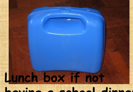
having a school dinner