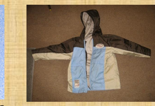
PE bag Waterproof coat Make sure everything is labelled!